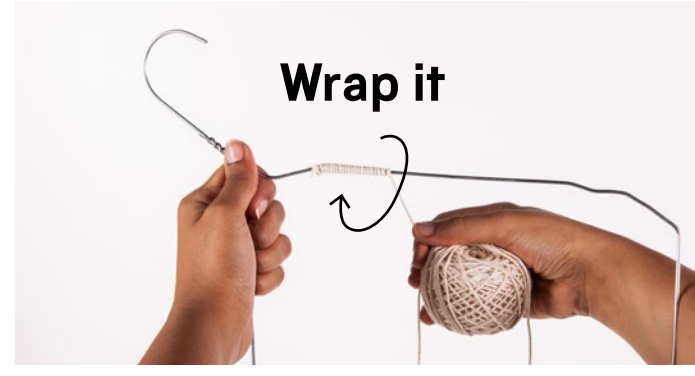
2 Make a big bubble wand using a stretchedout metal coat hanger, and wrap it in string all the way around.

Add the glycerine and the washing-up liquid to the warm water and stir the mixture slowly for a minute or two – this is to help the glycerine dissolve.