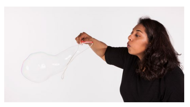
Thread a loop of string through a straw to make a smaller bubble wand.