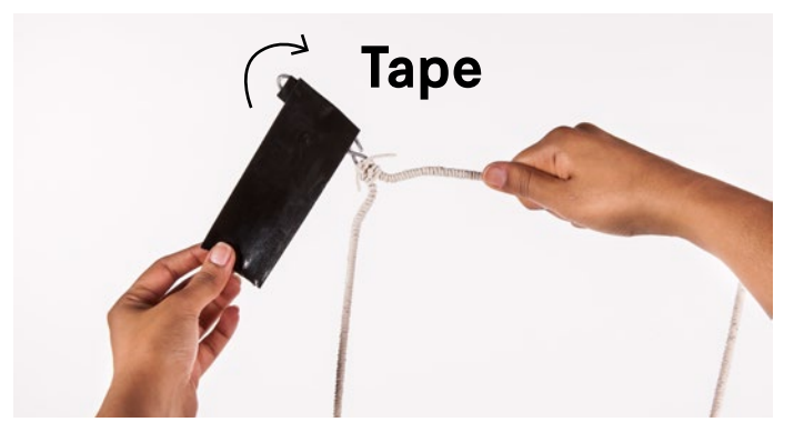
3 Tape the hook of the bubble wand to make a handle.