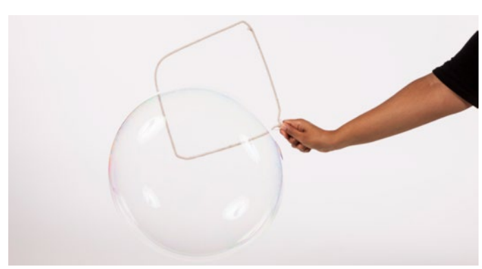
4 Dip the wand in the bubble mix and blow a bubble!