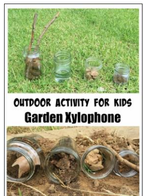
OUTDOOR ACTIVITY FOR KIDS Garden Xylophone

Nursery Make a garden xylophone by filling jars with different objects.